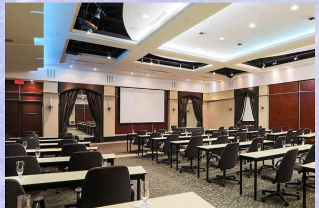
CENTRE MONT-ROYAL 2200 MANSFIELD STREET, MONTRÉAL, QUÉBEC H3A 3R8 CANADA

The Symposium will focus on “ Support Tools for Preference-Sensitive Decisions ” and include a panel discussion on developing and integrating such tools in clinical practice. Both the meeting and symposium will be held at the Centre Mont-Royal (right).